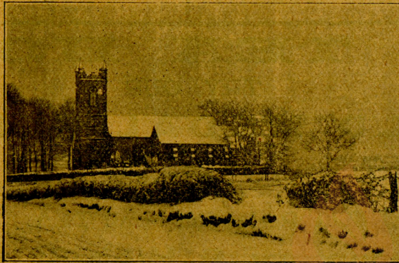
SEAGOE CHURCH IN WINTER.