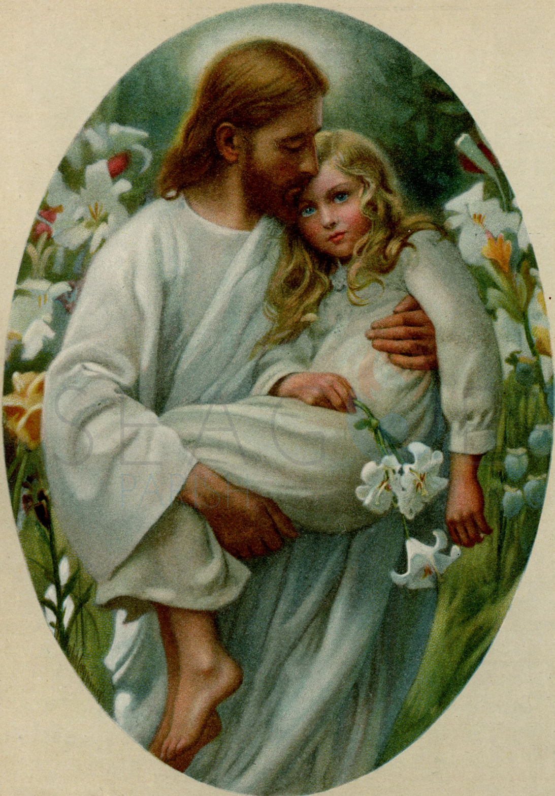
The Fairest Flower in the Master's Garden.